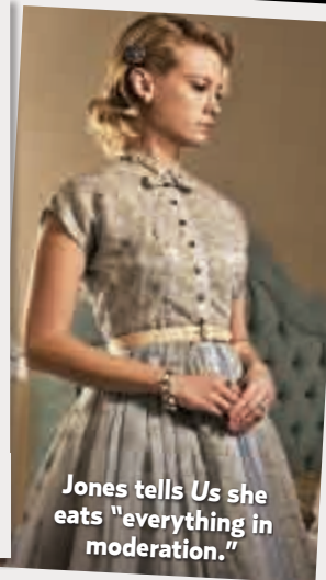
Jones tells Us she eats "everything in moderation."