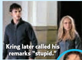
Kring later called his remarks "stupid."

HEROES CREATOR Tim Kring probably wishes he could go back in time and fix a mistake like Hiro Nakamura can. At an event in L.A. November 15, the writer-producer, 51, called some of his most loyal fans "saps and dips--ts" because they watch his struggling NBC series live and not on DVR or online (which he considers "superior to watching it on air").